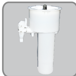
Removable Reservoir/Faucet Assembly (patent pending)