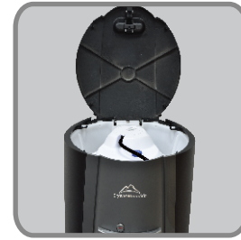
Retrofitted to Become a Point of Use Dispenser