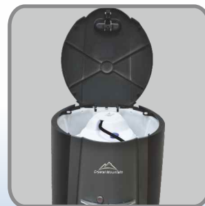
Retrofitted to Become a Point of Use Dispenser