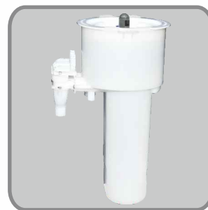
Removable Reservoir/Faucet Assembly (patent pending)