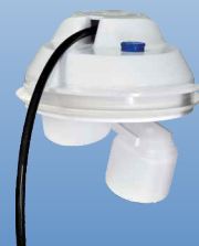
Point of Use Kit