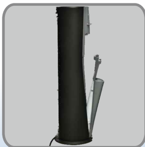
Replaceable Lower Front Panel with Optional Integrated Cup Dispenser