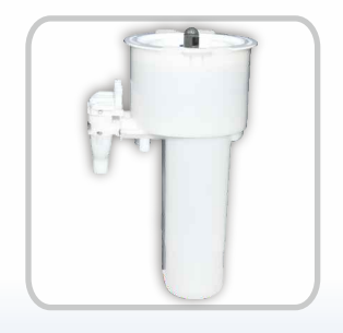
Removable Reservoir/Faucet Assembly (patent pending)