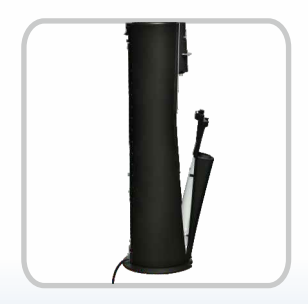
Interchangeable Lower Front Panel