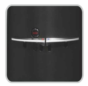
Sturdy Metal Faucet Handles